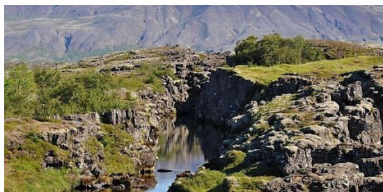
Continental drift: a geology lesson, 15 November

Finally, don't forget u3a online learning events which range in November from Summing up the Nineteenth Century (7 Nov) and The Drifting Continents (15 Nov) to A Deep Dive into the 1921 Census (18 Nov) and Bollywood Yoga Laughter Dance (25 Nov). Take a look!