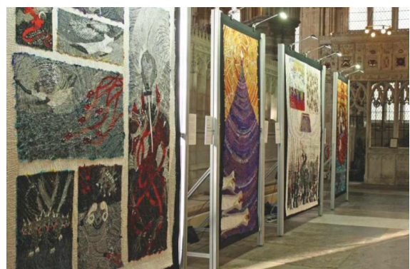
Tapestries at Hexham Abbey

Keeping it Legal workshop (delivered by national u3a), 10:00 am – 12:30 pm on Zoom