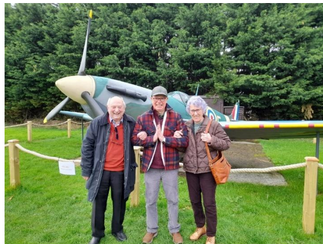
Our 3 adventurers in front of a Spitfire

have our photo taken in front of a model of the famous plane.